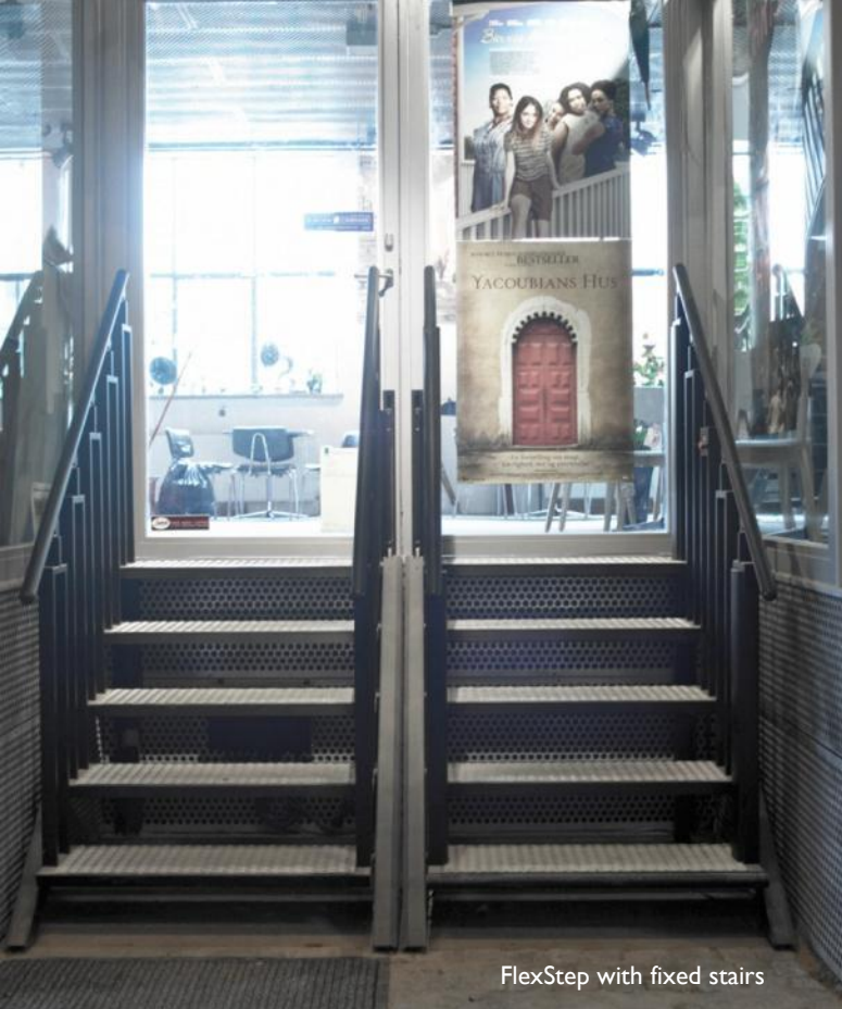
FlexStep with fixed stairs