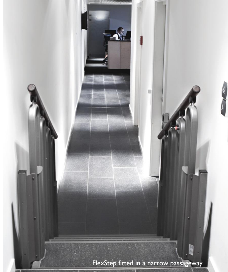
FlexStep fitted in a narrow passageway